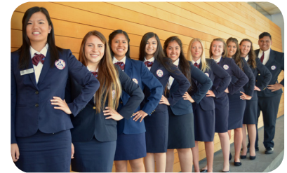
Utah HOSA State Officer Team