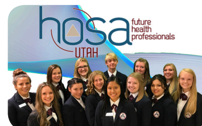
Utah HOSA State Officer Team